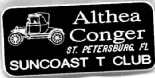
Black badge/White words